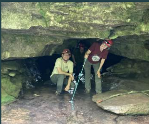
Members enjoying Henderson Park Discovery Day