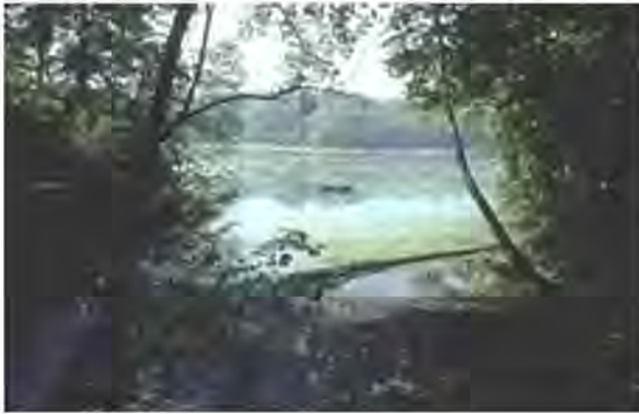
View of Spring Mill Lake

Spring Mill Lake, in Spring Mill State Park in Mitchell, Indiana, is fed largely by subsurface drainage through an extensive sinkhole plain or karst system. The lake has been a subject of concern because it is suffering from sedimentation problems (resulting from tillage and construction projects) and from nitrogen enrichment. As a result, geologists became interested in assessing the extent to which the lake, and the associated ground water in the karst system, may be subject to influxes of sediments, chemical