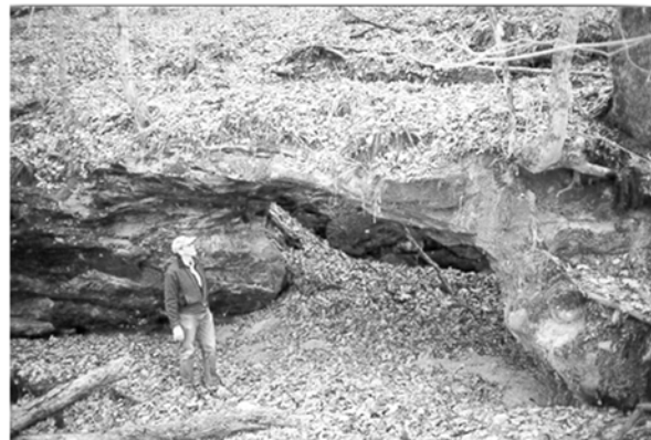
Dick Vernier admiring a sandstone natural bridge located during the January HNF workday near Tucker Lake.

If you would like to help out with any of these projects, please let me know.