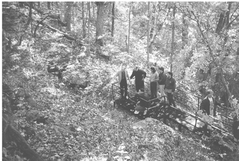
Vistors at Leonard Springs Nature Park looking into Shirley Spring Shelter Cave.

If you would like to help out with the cleanups, educational efforts, or anything else associated with this little nature park, please let me know.