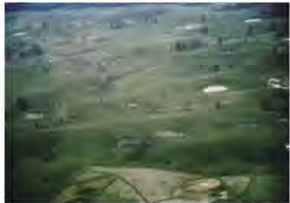
Karst topography near Spring Mill SP