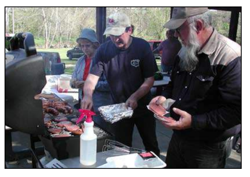
Another action photo from the Indiana Cave Symposium held on April 21 at Cave Country Canoes campground.

Activities planned for 2007 include reinstalling the plaque on the limestone base of the National Natural Landmark marker, quarterly trash pickups, and cleaning further trash from a small ravine located on the west side of the property which contains old bicycles, fencing, boards, posts, and other items.