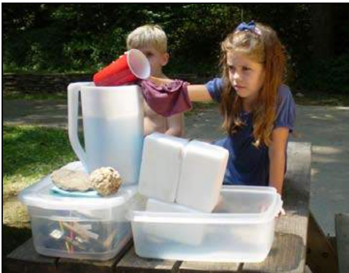
An inquisitive girl learns how caves are formed with a Project Underground activity during the Gone Caving! event at Spring Mill State Park.