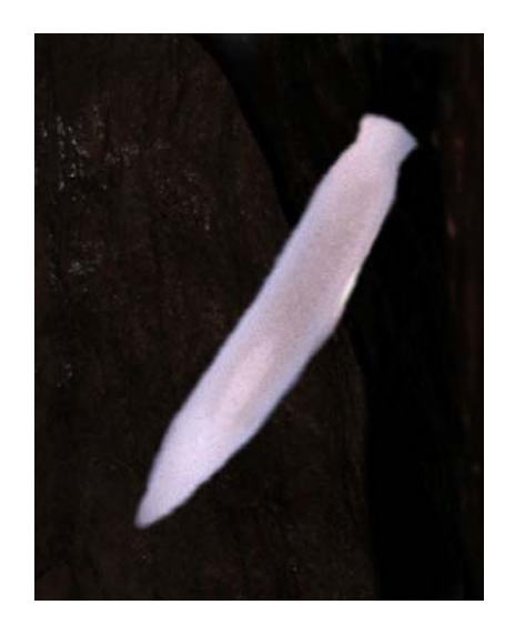
Weingartner's cave flatworm