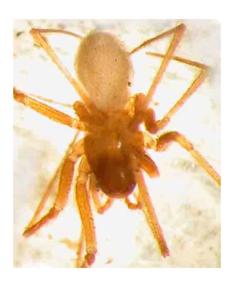
Cave sheet-web spider